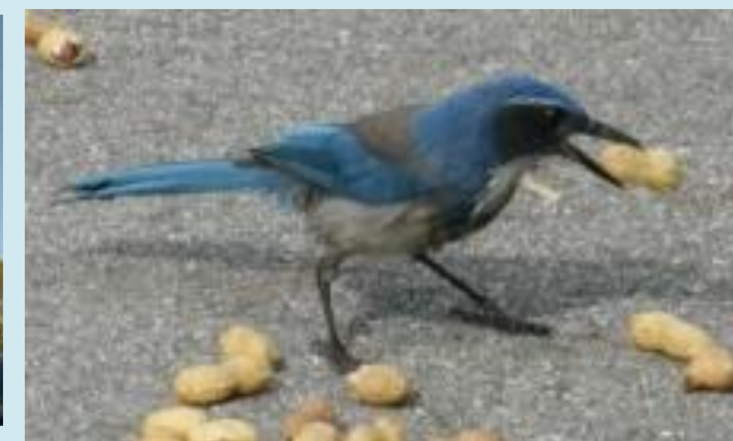
Western scrub jay ( Aphelocoma californica )