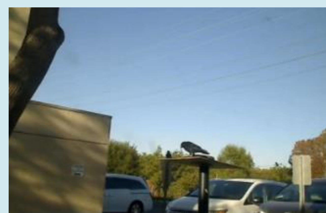
Research Annex baiting platform. Image taken using motion capture camera